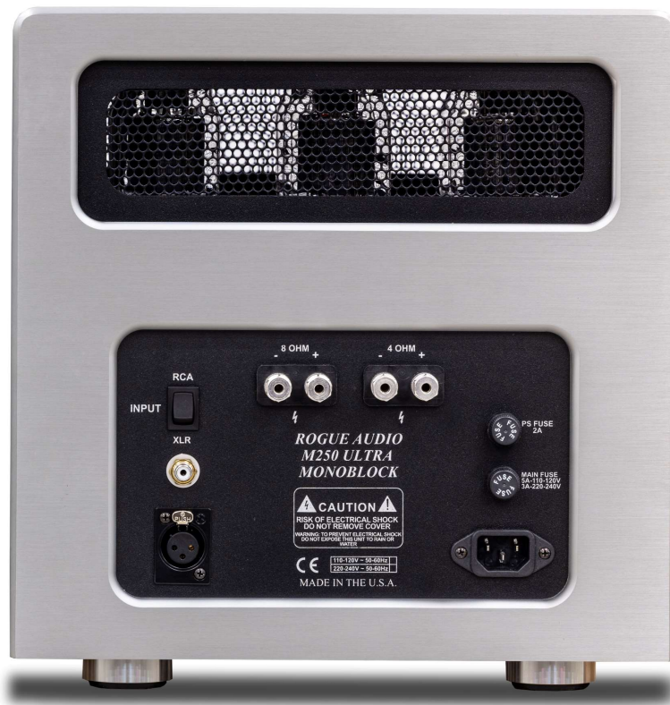
Figure 1. Rear panel layout

Note that a second preamplifier or home theater processor can be connected to the second set of inputs.