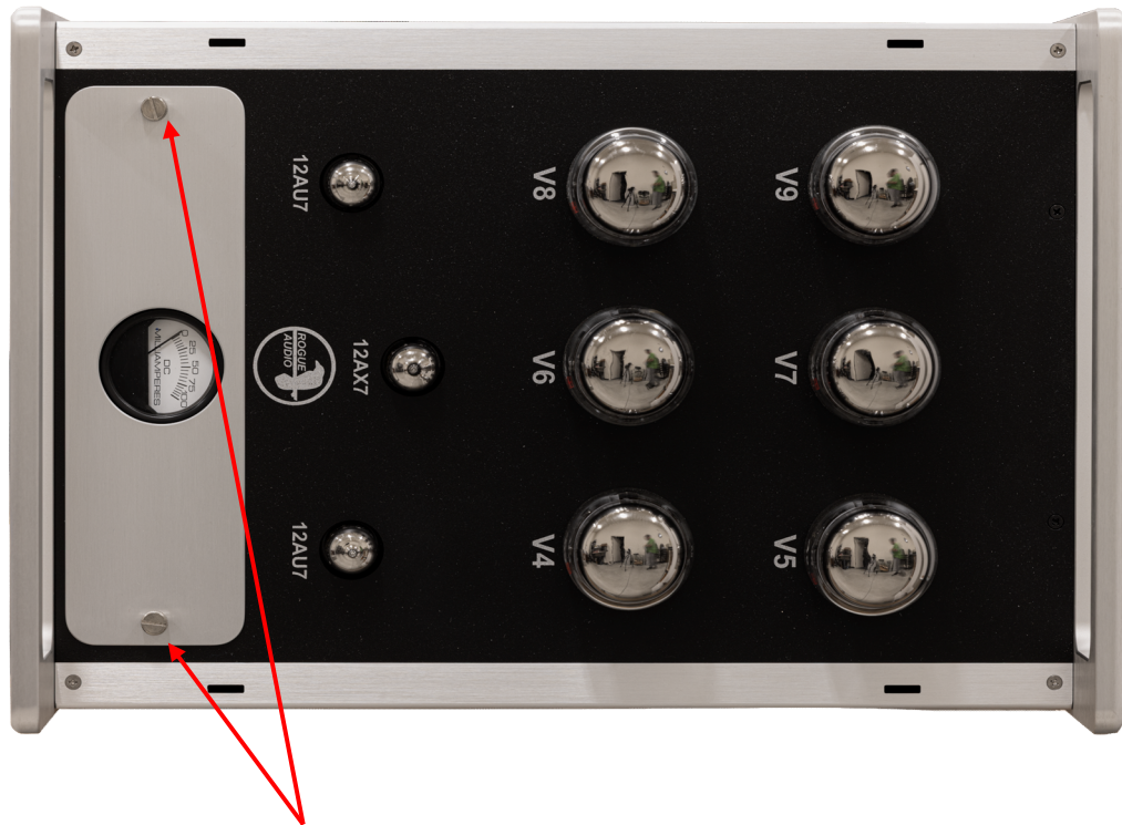
Figure 2. Removable hatchplate